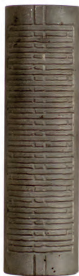
18 Alice Wang, Untitled , 2017, iron meteorite, 9 × 30 cm. © the artist. Courtesy the artist and Capsule Shanghai

Sakarin Krue-On Tang Contemporary Art, Bangkok through 23 September